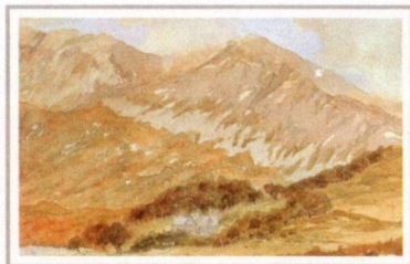
TO COMMEMORATE THE 50TH BIRTHDAY OF HRH THE PRINCE OF WALES

New definitive packs New presentation packs (Nos 41 and 42) containing the current low value definitives (1p-£1 and 1st and 2nd NV1 stamps), and the current Northern Ireland, Scotland, and Wales country stamps will be available from the Bureau and philatelic outlets from 20 October, price £5.50 and £4.75 respectively ●